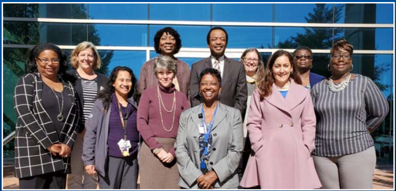
Gerontology Center Community Advisory Council

Vision: the Center will identify and address relevant aging issues applicable to older minority populations, and increase the capacity for older adults to lead independent, healthy and functional lives while remaining productive members of their community.